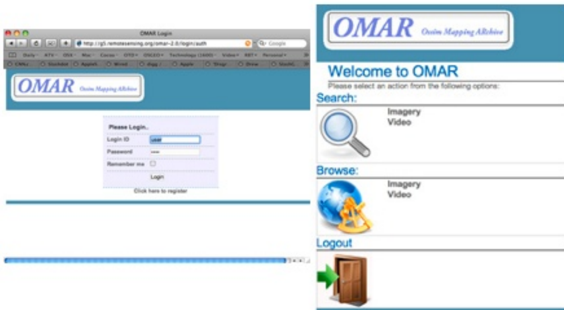
Figure 2: OMAR Web Interface for Searching Geospatial Assets