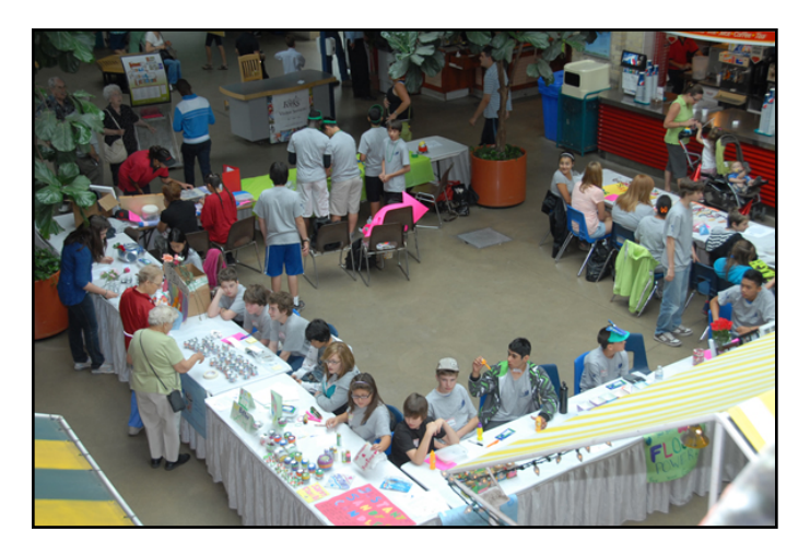
Figure 2. BizCamp students selling their wares

The second age group included 15 to 18 year-olds who participated in a two-week day camp. These students were not only taught the fundamentals of starting a small business, but also how to develop a business plan. They were coached on presentation skills and were then required to present their business plan to a